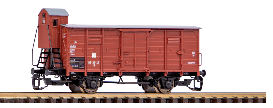
47760 Box Car G02 DR III, with brakeman's cab

First procured by the Prussian State Railroad, these cars were also a common contemporary for the Deutsche Reichsbahn for a long time. Accordingly, the joy of the fans of the scale 1:120 should be great that these newly designed freight cars are now also available in this scale. As usual for PIKO, the look is convincing with finest engravings. This makes it possible to precisely identify the individual planks of the cars, which are built in unit construction. The same is true for the bogies: from the spring assemblies to the brake shoes, all individual parts are easily recognisable. For maximum enjoyment, the cars are already fully assembled and equipped at the factory. Many attached parts are separate and free-standing. The clean finish not only results in a magnificent sight in collectors' display cases, but also in a particularly high level of driving pleasure. Detailed and yet robust, the freight cars roll over a wide variety of track layouts.