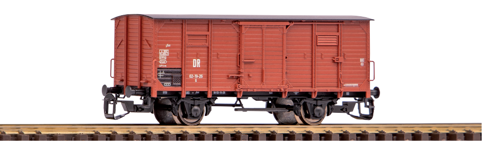
47761 Box Car G02 DR III, without brakeman's cab